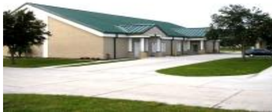
3-Views Steel Church bldg w/Metal roofing